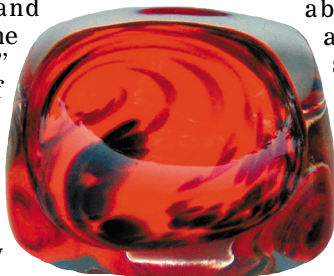
An Autumn Square Phoenix Stone, similar to comfort or worry stones associated with several cultures, was created by Art From Ashes in Amherst.